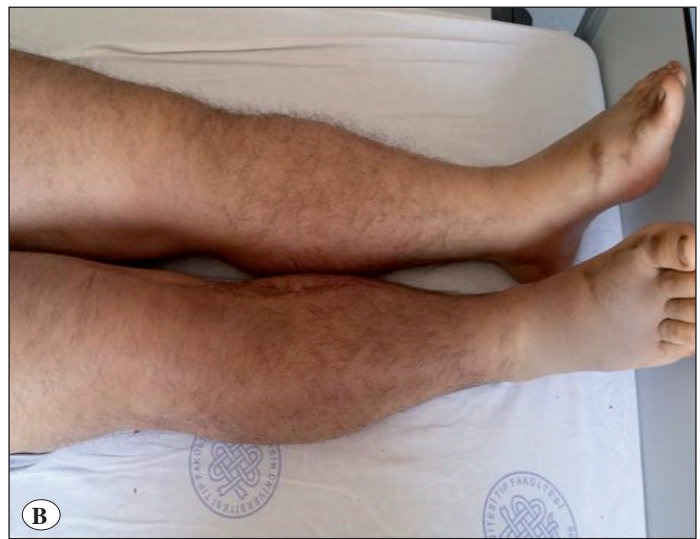
Figure 1: A) Diffuse ecchymoses developed after the injection of deltamethrin into his legs, B) Ecchymoses disappeared at follow-up.