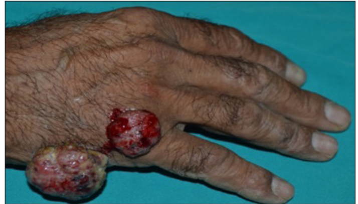
Figure 1. Two mass lesions with ulcer and bleeding on the back of the right hand.